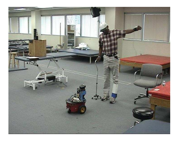
Fig. 2. Therapist robot encouraging and monitoring stroke patient during the rehabilitation therapy (work done at USC [6])

Individuals with cognitive disabilities and developmental and social disorders constitute another growing population