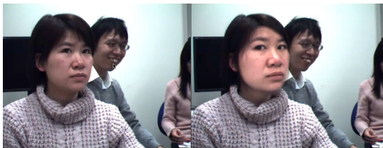
Figure 1: face-swap: B's face is superimposed on A's face

We propose to compare the contingency of movements and familiarity of faces factors in self-recognition in an experiment where an imitator reproduces the head, arms and body movements with or without delay. The imitator's face may be identical to the subject's face or look different. We thus developed a face-swapper for videos that detects the face position and orientation of the current subject A, then superimposes the image of a subject B on A's face (fig. 1 where A and B's faces are identical).