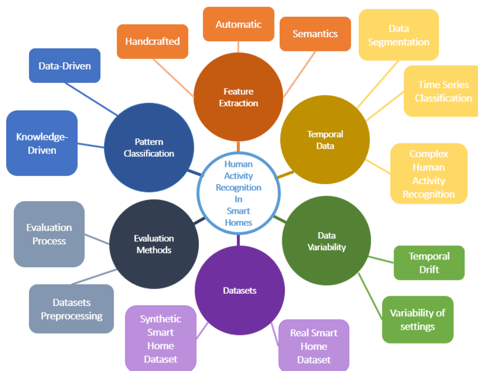
Figure 2. Challenges for Human Activity Recognition in smart homes.